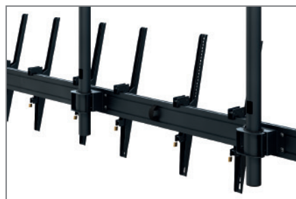
Adaptable thanks to modular design