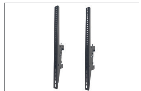
VESA max. 400 x 600 mm