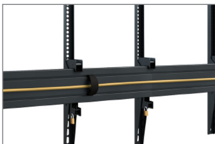
Cable management along the rails by clips